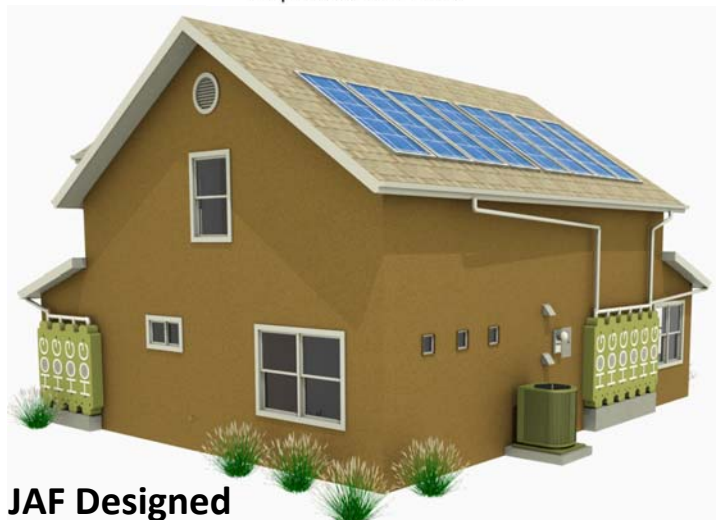
JAF Designed SANTA FE, NM LEED HOME 10 HOG recovery tanks with gravity feed hose bibs for each side of the home