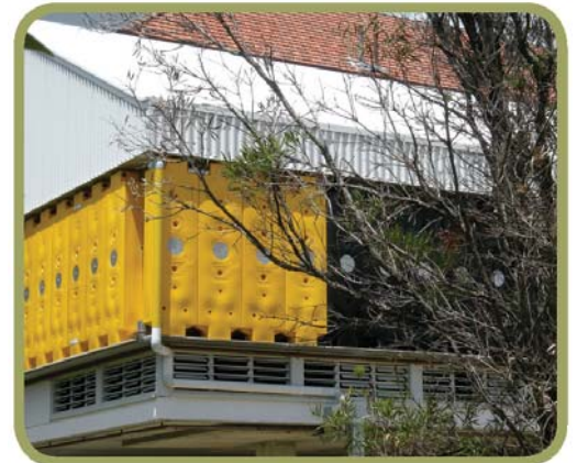
Nundah School Library 114 HOGs hold 5,700 gallons