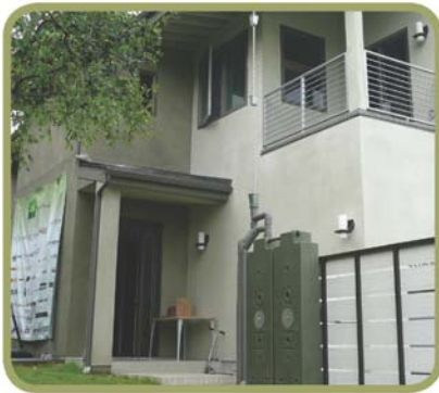
This LEED Platinum home in Los Angeles, CA with 2 HOGs